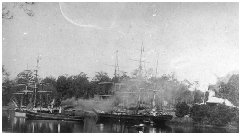
Ships at Clarence Town