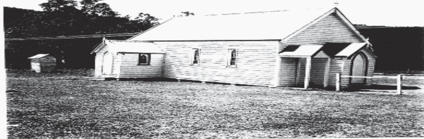
Melbury Church - 1906-1998-