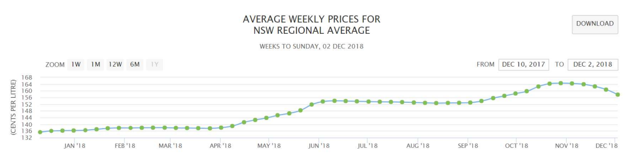
Table 14 Average Weekly Prices Regional NSW

Over the past 12 months the average price of regional fuel has varied from 136 cents per litre to 164 cents, a variation of 20%.