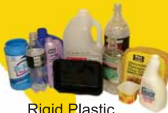
Rigid Plastic Containers