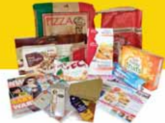
Paper & Cardboard Products