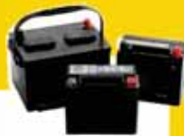
House & Vehicle Batteries