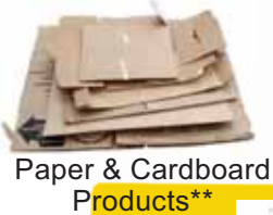
Paper & Cardboard Products**