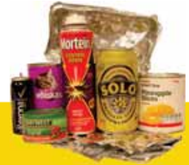
Steel & Aluminium Cans