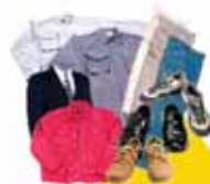
Usable Clothing & Household items